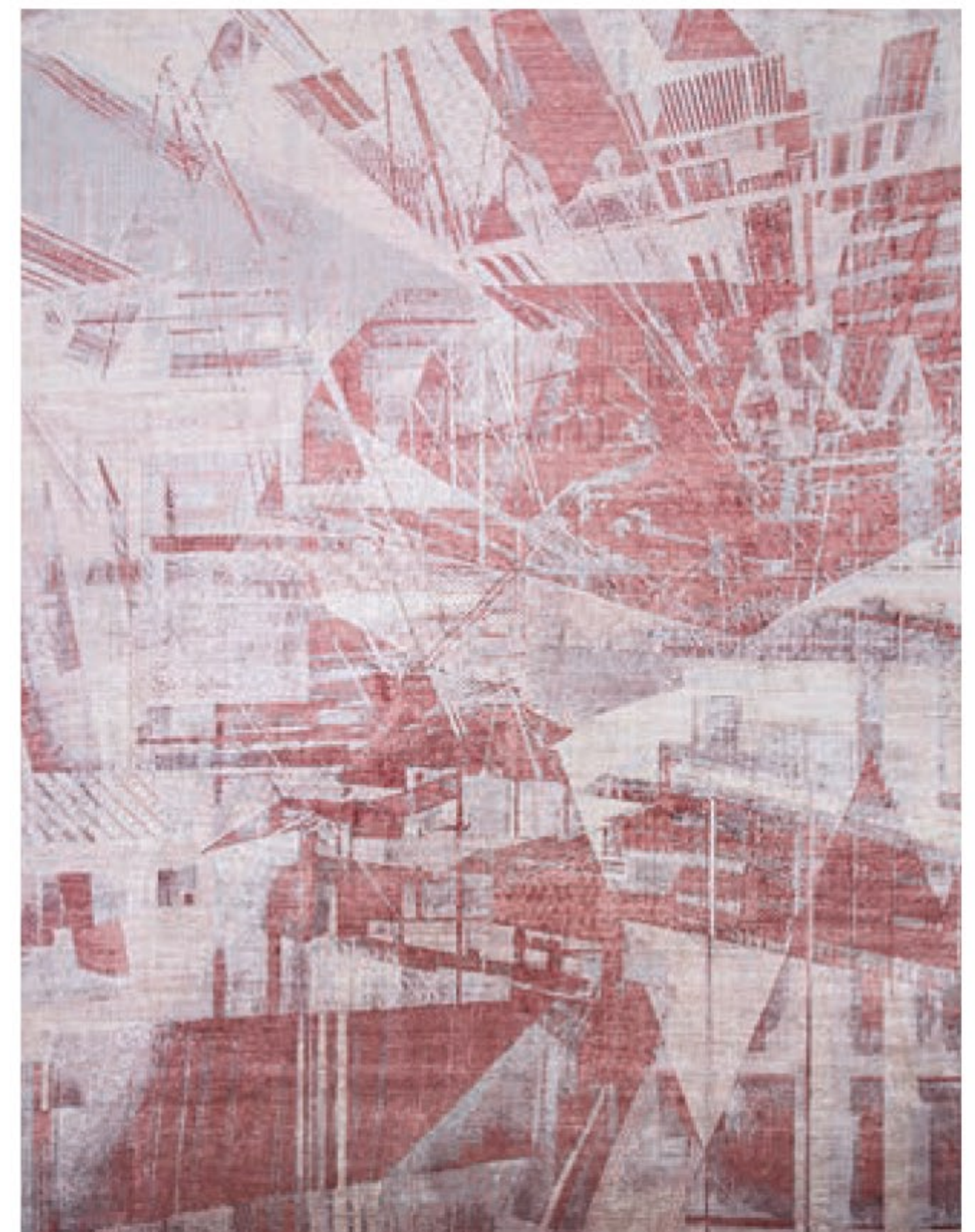
Sambhav promoted its flagship Nouveau Orient collection, available as hand-carved, acid-washed and flat-pile. Pictured is Cityscapes. Visit: www.sambhav.com