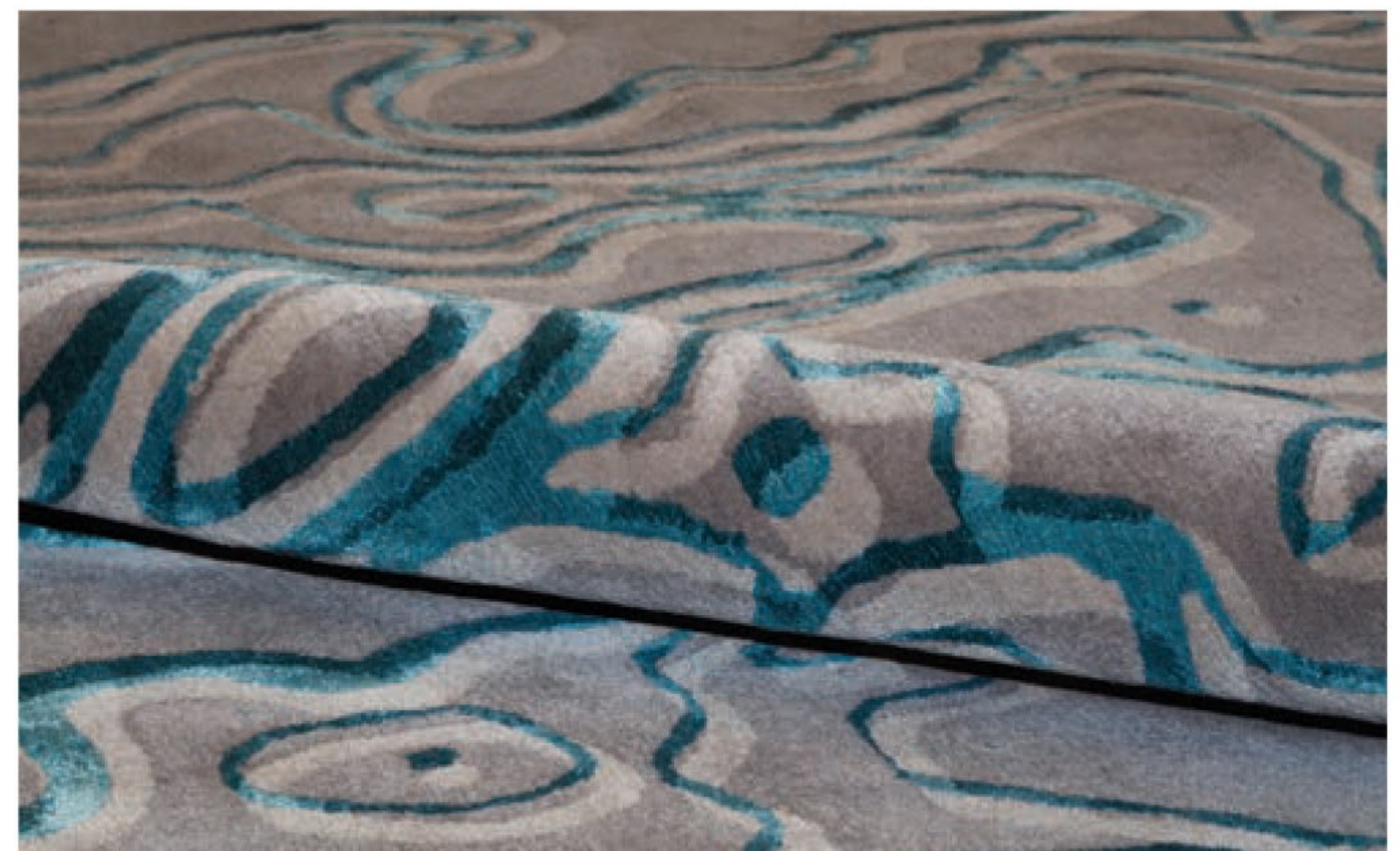
NOA Living's Energy Field collection includes Ion, which uses two shades of blue silk to represent meandering water. Visit: www.noaliving.com