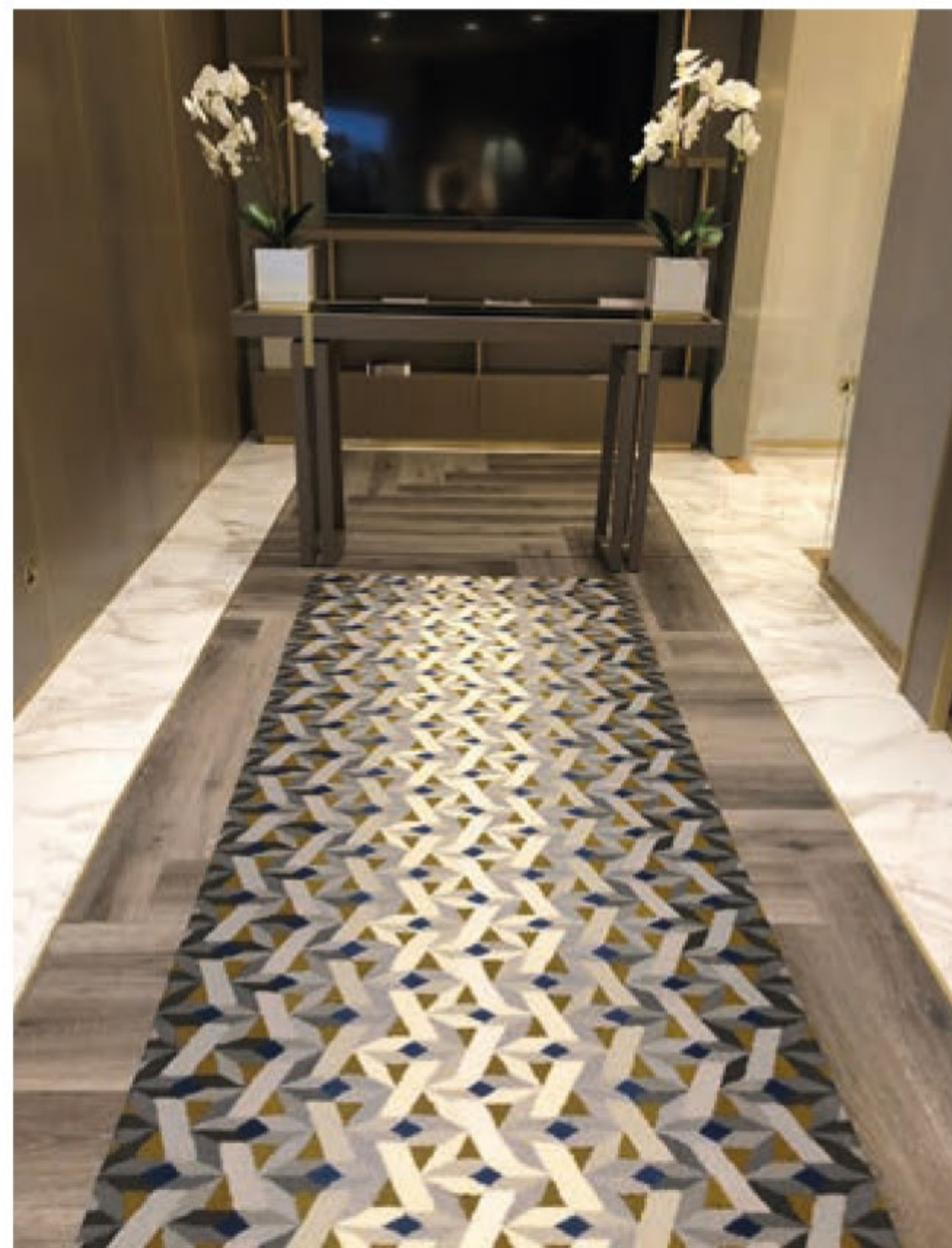
Topfloor by Esti's Matrix collection turns Gianluca Franzese's mesmerising artwork into rugs. Pictured is Facet. Visit: www.topfloorrugs.com