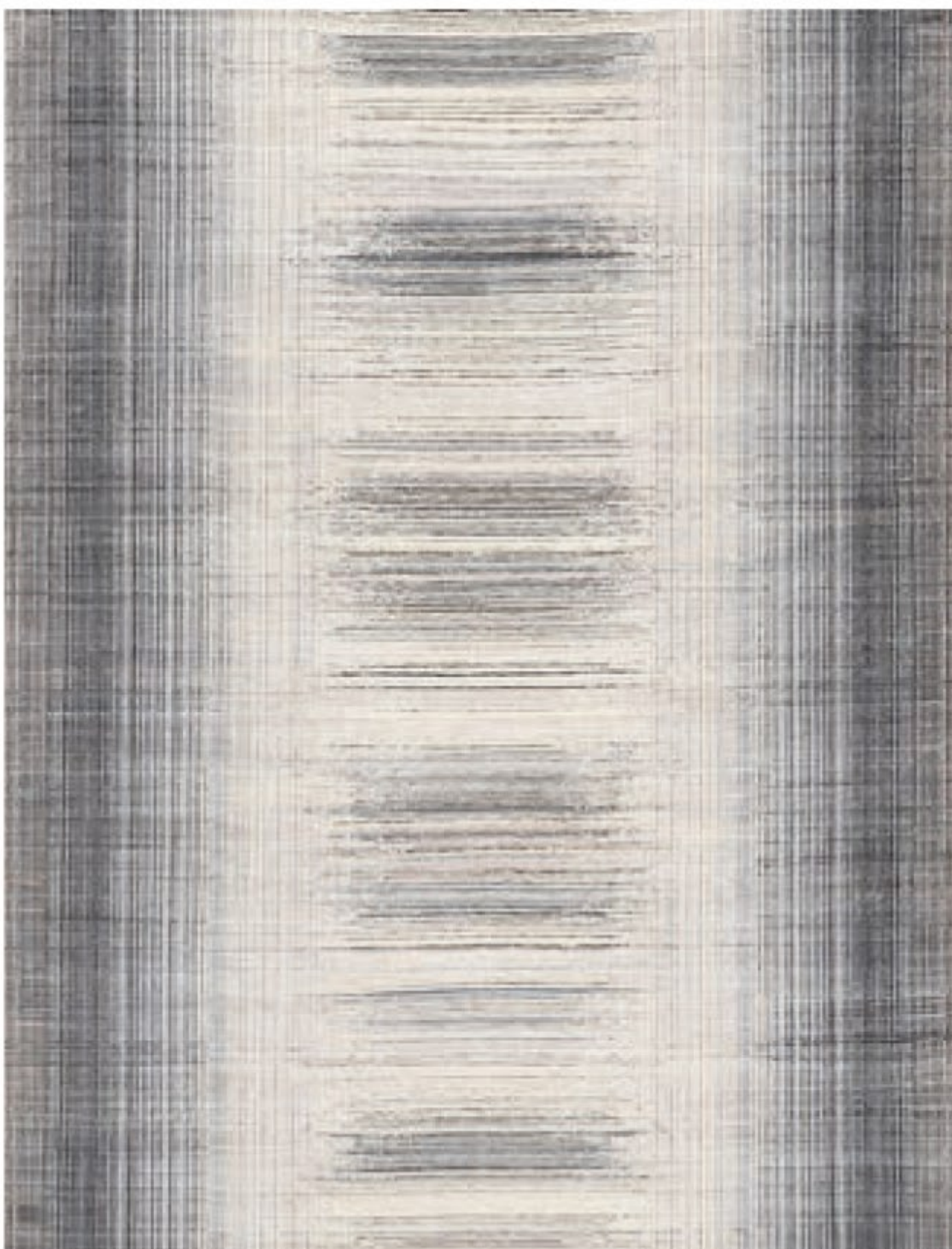
Thibault Van Renne's Artline is an artistic play of lines to create unique and simple, yet attractive patterns, with a choice of 15 colour combinations. Visit: www.thibaultvanrenne.com