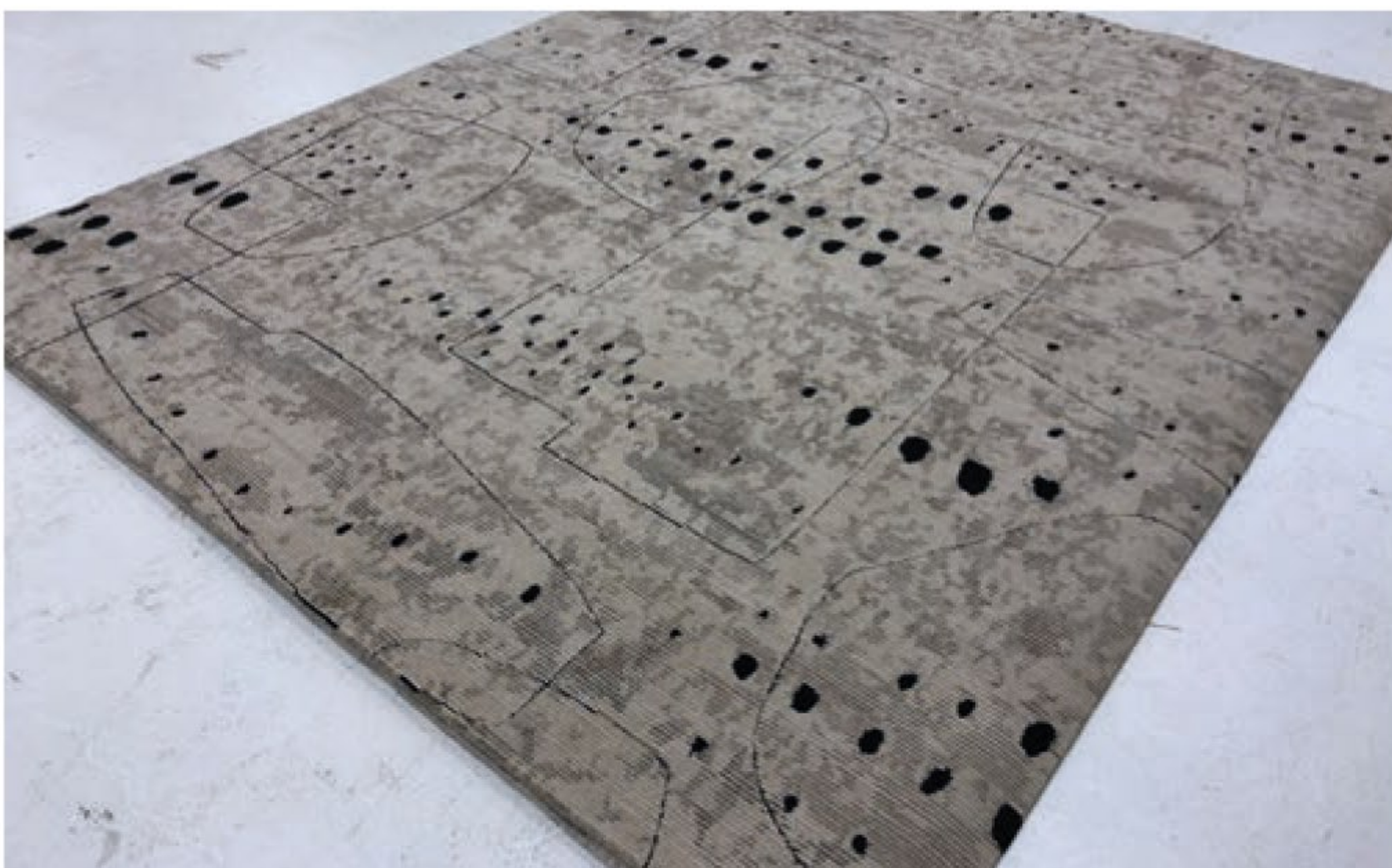
Tamarian's Loft Natural Charcoal gives space to a two-layered textured field, resulting in a subtle, multi-dimensional experience. Visit: tamarian.com