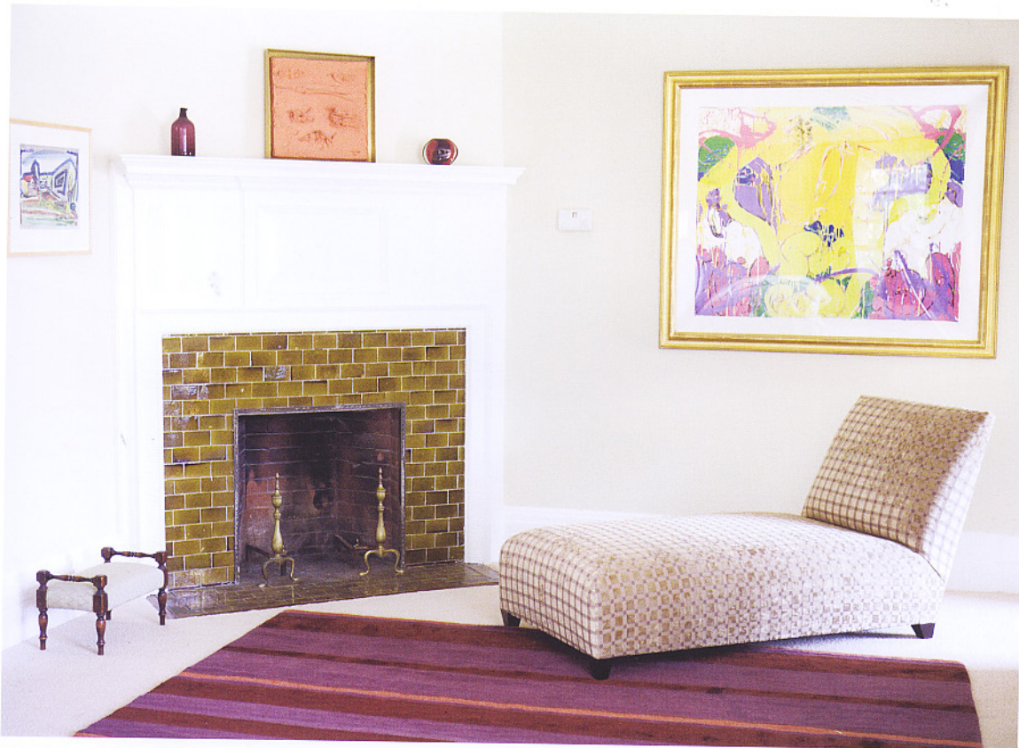
Tube Plum rug by Warp & Weft