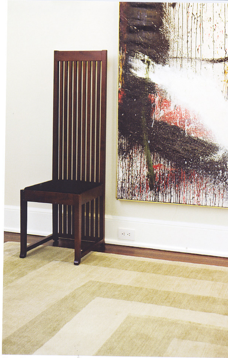
Squares Sage rug by Warp & Weft